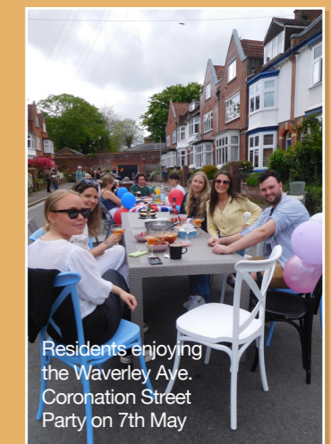
Residents enjoying the Waverley Ave. Coronation Street Party on 7th May