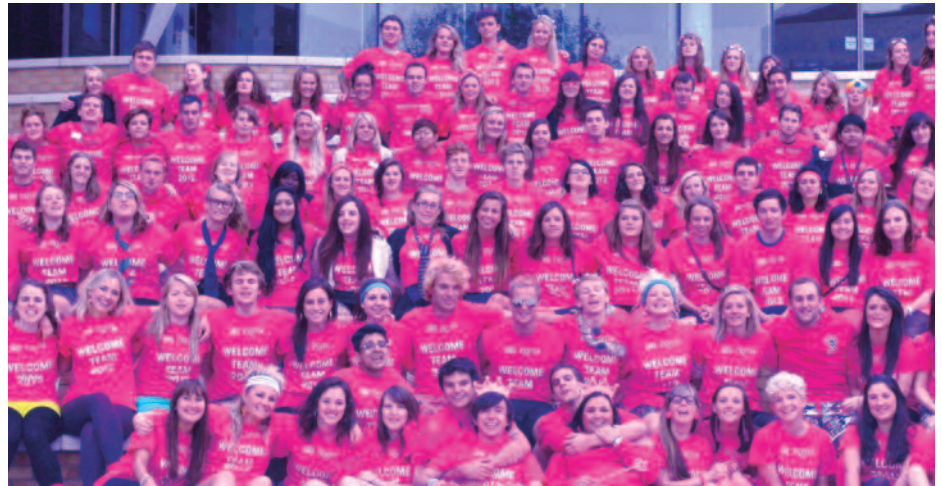
The Peace Makers – the 200 strong freshers welcome team

A bin audit has been completed in the key student streets in St James ensuring that the