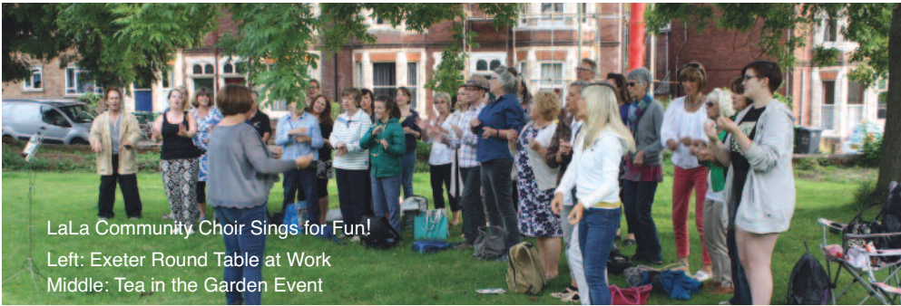
LaLa Community Choir Sings for Fun! Left: Exeter Round Table at Work Middle: Tea in the Garden Event