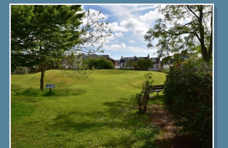
Above: Danes Castle (scheduled monument)

the earthwork was a temporary campaign structure, never completed and abandoned after Baldwin de Redvers surrendered. It is suggested that the site was again occupied during a later siege of the city in 1645-6 when occupied by Parliamentarian forces under the command of General Fairfax. So, no Vikings here!