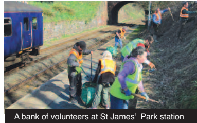
A bank of volunteers at St James' Park station

St James' ward has also been entered in the Britain in Bloom scheme this year, so we hope all residents and businesses will support this entry. Please do encourage your neighbours to have their gardens, or windowboxes, looking their very best in July. We will all benefit from seeing them and that's the month when the judges will be visiting us.