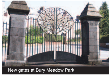
New gates at Bury Meadow Park

Many St James community green spaces will be entered for the RHS It's Your Neighbourhood scheme again this year, namely Bury Meadow Park, Queen's Crescent Garden, Devonshire Place Orchard, Powderham Crescent Garden and St James Park station and allotments. Also St Sidwell's Community Centre will be entering for the first time and it is hoped that even more green spaces, for instance our sports' clubs, will consider joining the scheme in 2016.