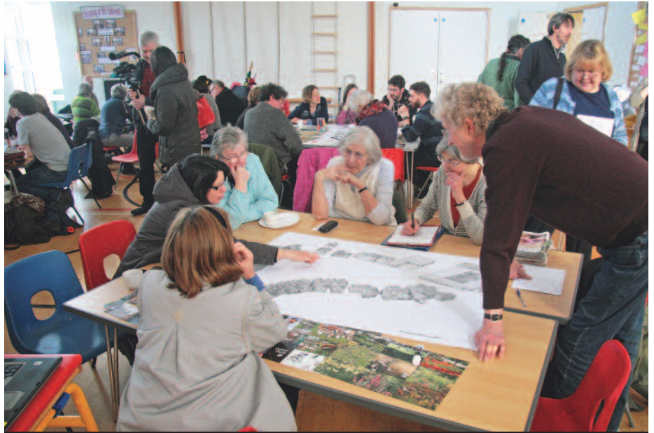
This was the scene at a community consultation event last year developing plans for Queen's Crescent Garden.

HOWELL ROAD, EXETER www.rustybike-exeter.co.uk 01392 214440